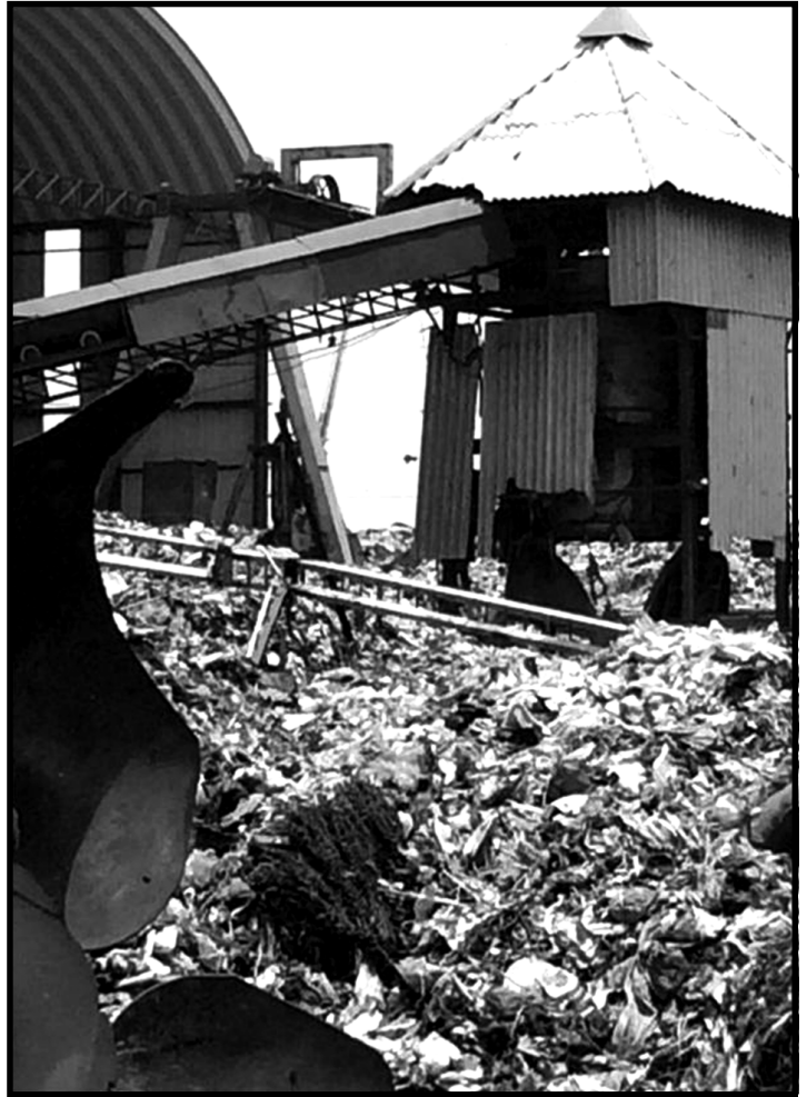
Photo: Recent photographs of the site at Rajkot